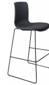
Acti Stool - Seat Upholstered