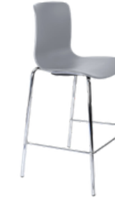
Acti Stool - High Chrome 4-Leg Frame 760 H