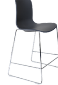
Acti Stool - Low Black Sled Frame 630 H