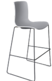
Acti Stool - High Black Sled Frame 760 H