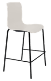
Acti Stool - Low Black 4-Leg Frame 630 H