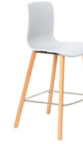
Acti Stool - Low Timber Frame 630 H