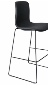
Acti Stool - Fully Upholstered