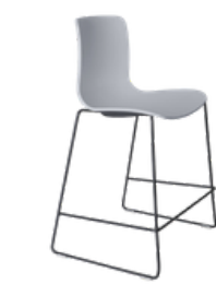
Acti Stool - Low Black Sled Frame 630 H