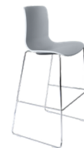
Acti Stool - High Chrome Sled Frame 760 H