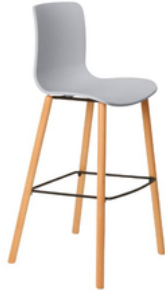
Acti Stool - High Timber Frame 760 H