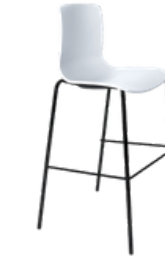
Acti Stool - High Black 4-Leg Frame 760 H