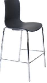
Acti Stool - Low Black 4-Leg Frame 630 H