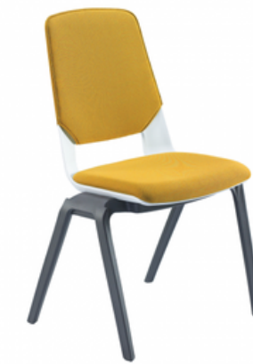
Klik Full Upholstery