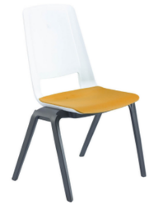
Klik Seat Upholstery