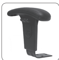
A5 Height adjustable arm

Sturdy Framac pursue a policy of continuous improvement and reserve the right to introduce modification when required and to withdraw models without previous notification.