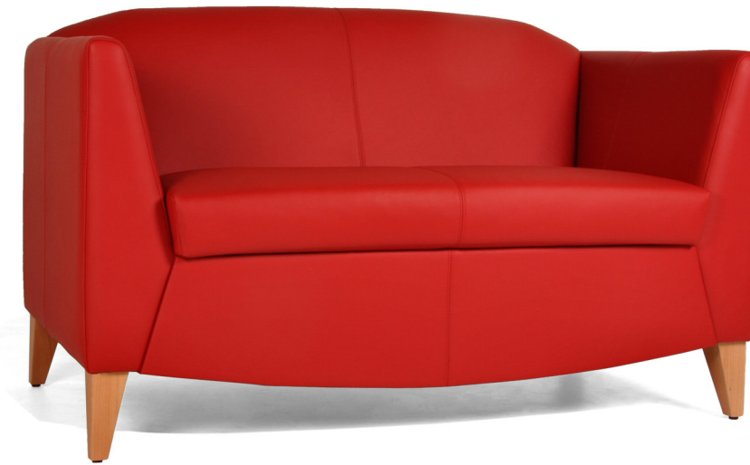
L - VNLNG2

L-VNLNG1 (Single seat) L-VNLNG2 (Two Seater) L-VNLNG2.5 (Two and a half seater) L-VNLNG3 (Three seater)