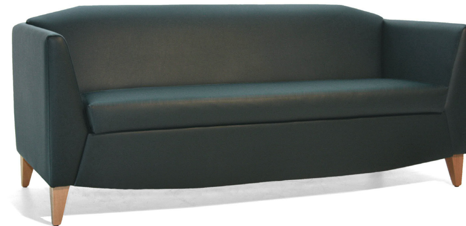
L - VNLNG3