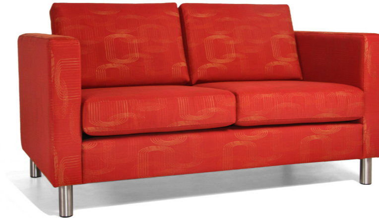
L - AMLNG2