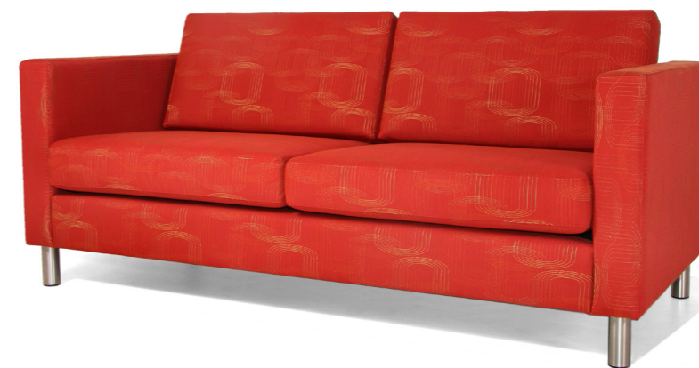
L - AMLNG2.5