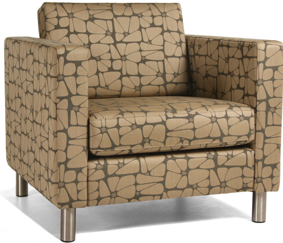
L - AMLNG1