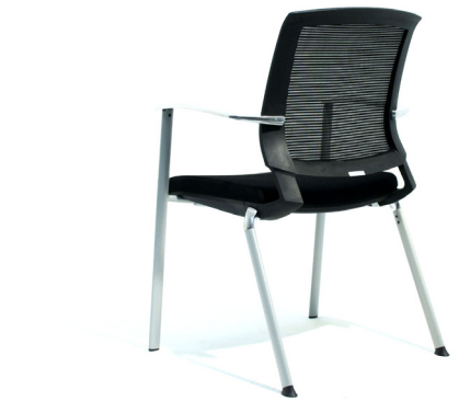
FA945 - WHT