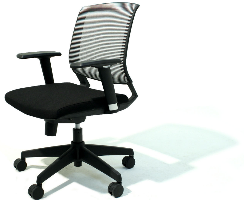
FA29A5 - WHT