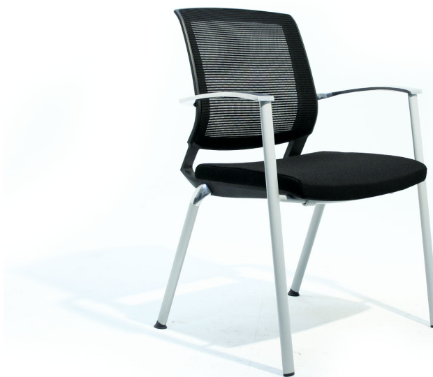
FA945 - BLK

Product Options: BLK - Black mesh back WHT - White mesh back