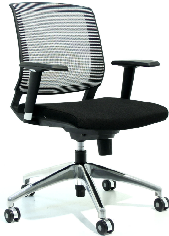
FA29A5B11 - WHT