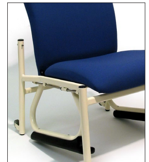
A52 Swing away arms