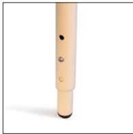
F7 Height adjustable legs