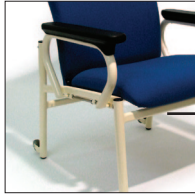
A52 Swing-away armrests