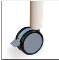
C7 75mm castors (lock)