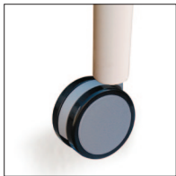
C6 75mm castors