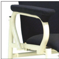
A50 Upolstered armrests

Option codes must be placed in alphabetical order after chair code.