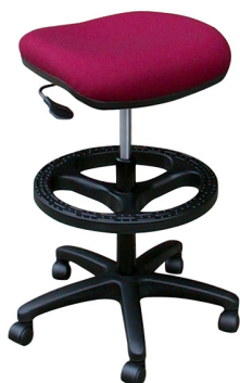
Lynx Stool, moulded seat, footring