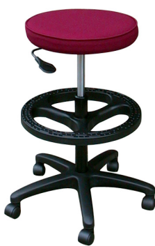
Lynx Stool, 15" round seat, footring

Sturdy Framac pursue a policy of continuous improvement and reserve the right to introduce modification when required and to withdraw models without previous notification.