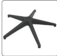
B10 Black spider base