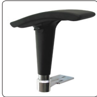
A4 Chrome adjustable arm