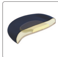
E Ergosit seat cushion