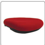
S6 Larger seat option