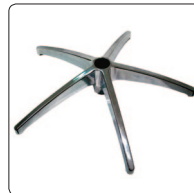
B11 Polished spider base