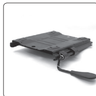
SS Slide seat