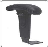
A5 Height adjustable arm

Option codes must be placed in alphabetical order after chair code.