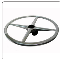
D11 & D12 Aluminium footring