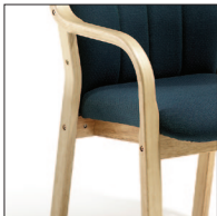
NL Natural laquer

Option codes must be placed in alphabetical order after chair code.