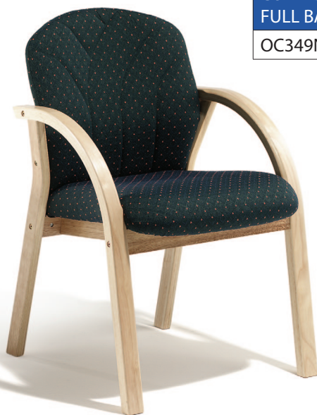
CURVED LEG - FULL BACK OC349NL