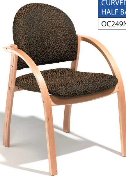
CURVED LEG - HALF BACK OC249NL