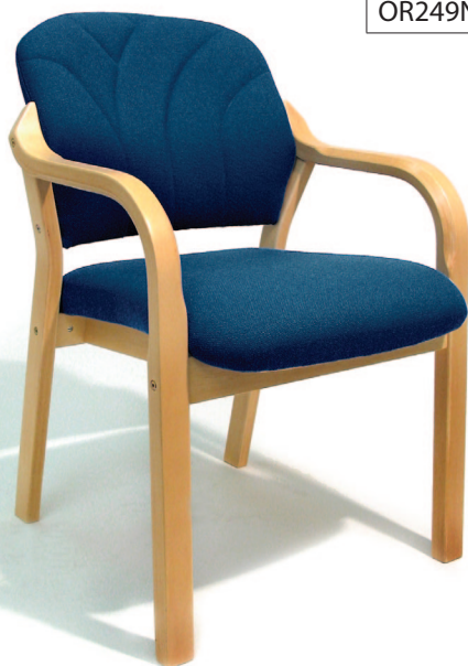
STD LEG - HALF BACK OR249NL