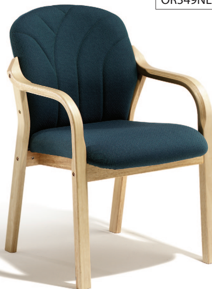
STD LEG - FULL BACK OR349NL