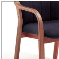
ST Stained frames