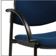
A35 Curve arms

Option codes must be placed in alphabetical order after chair code.