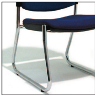
CHR Chrome frame