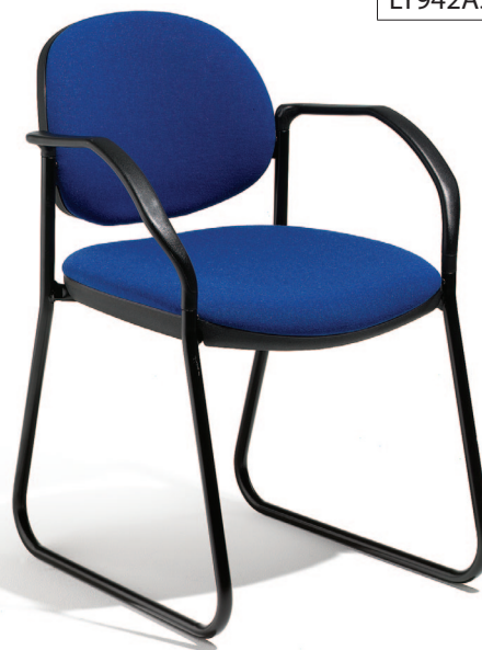
SLED - SWOOP ARM