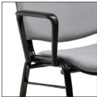
A10 Standard arms

Option codes must be placed in alphabetical order after chair code.