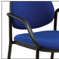
A32 Swoop arms