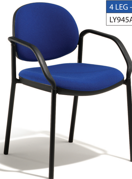
4 LEG - SWOOP ARM