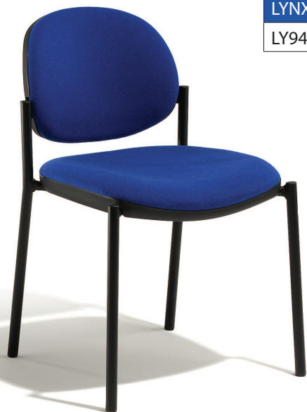
LYNX 4 LEG