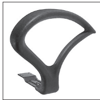
A6 Tulip arm