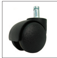
C1 Brake castors