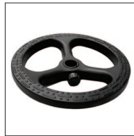
D3 & D4 Black plastic footring