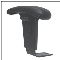
A5 Height adjustable arm

Option codes must be placed in alphabetical order after chair code.