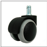
C2 Brake castors