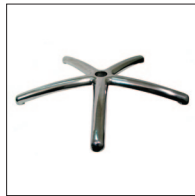
B1 Polished aluminium