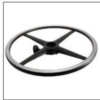
D1 & D2 Aluminium footring