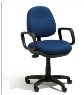
Nova H/D, medium back, tilt, arms, standard base

Not all models have AFRDI certification. AFRDI certifies for select models available upon request.