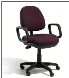
Nova H/D, medium back, tilt, arms, standard base