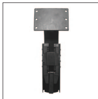
M2 Ratchet back mechanism