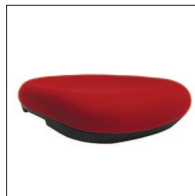
S5 Large seat (515W x 480D)