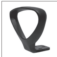
A16 Loop arm